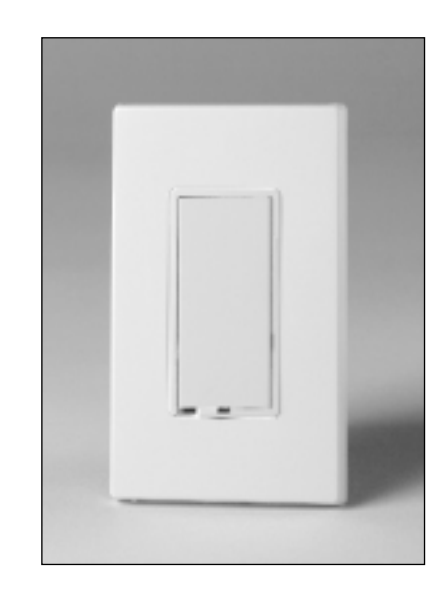
Cat. No. TTI10-10