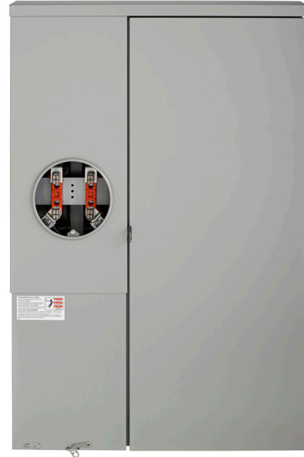
Cat. No LJ315-BED

Surface Mount, Side-by-Side Construction, Ring Type, UG Service Entrance, EUSERC