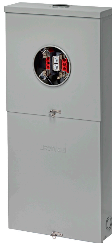
Cat. No. LS815-BRC

SPACIOUS - Ample room for hands to move and work freely