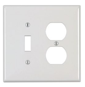
Combination Accommodates a variety of switch, outlet and other multi-gang configurations.