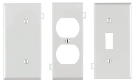
Sectional Ideal for multi-gang installations. Pieces snap together for a finished look.