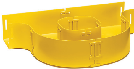
Pictured: Fiber Storage Loop Inline

Fiber Raceway Fiber Storage Loops allow excess patch cord lengths to be safely stored and organized throughout the fiber duct system. Inline Storage Loops contain fiber within the duct system while the Offset Storage Loop retains fiber away from the main duct.