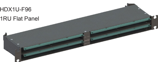
HDX1U-F96 1RU Flat Panel

Opt-X HDX Flat Panel offers a high-density interconnect or cross-connect between backbone horizontal cable and active equipment while minimizing rack space in a frame or cabinet. The 1RU panel allows for pre-terminated solutions and open access to patch cords. This panel is ideal for deployment above cabinets, within racks, and within cabinets in data centers, equipment rooms, and central offices.