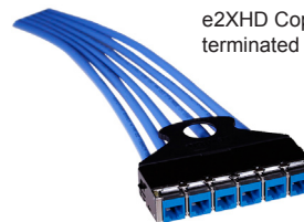
e2XHD Copper Cassette, terminated to trunk cable

Removes QuickPort modular copper connectors and fiber adapters from cassettes