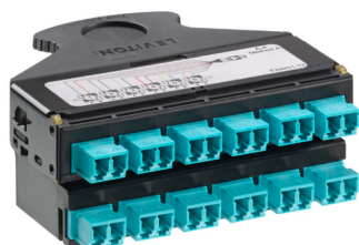
e2XHD MPO-LC 24-Fiber Cassette