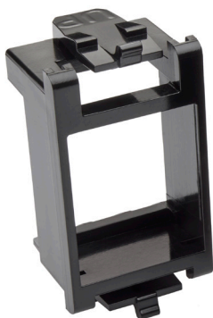
Bezel (not to scale)