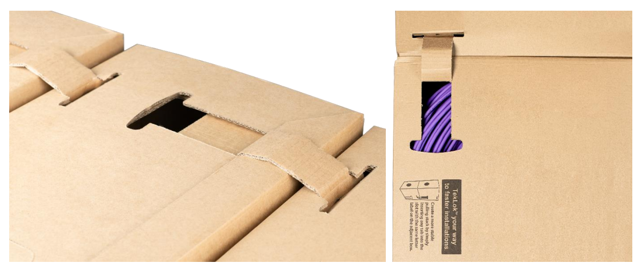
Figure 2: Examples of locks in use

same letter, when the payout holes are aligned in the same direction. Please see Figure 2 for examples of these locks.