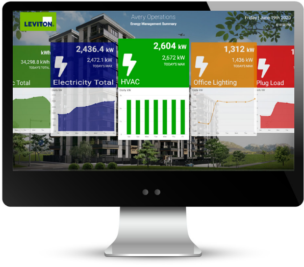
Public Kiosk Display