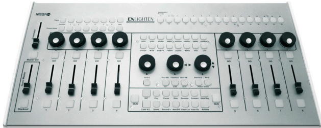
Enlighten Control Wing