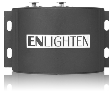
Enlighten 512 Channel USB Interface