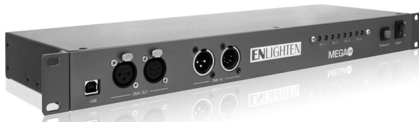
Enlighten 512 Channel Splitter & USB Interface