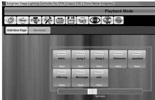
Add New Page Screen