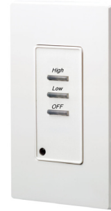
SDSP4-G2W + SDS00-15W