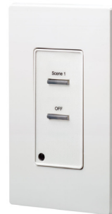
SDSP1-02W + SDS00-12W