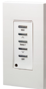
SDSP1-R5W + SDS00-15W