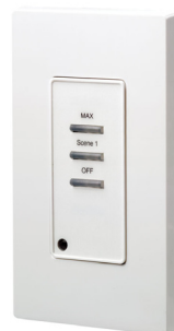
SDSP1-M2W + SDS00-15W