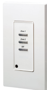
SDSP4-G1W + SDS00-15W