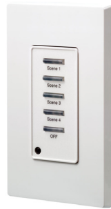
SDSP4-05W + SDS00-15W