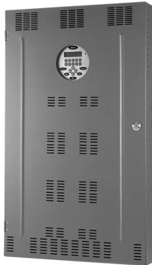
24 Relay Panel