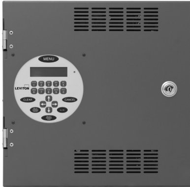
8 Relay Panel