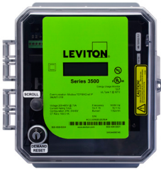
Series 3300/3500 Meter