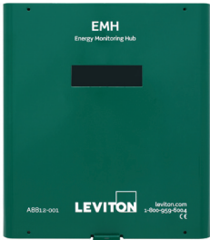
Energy Monitoring Hub