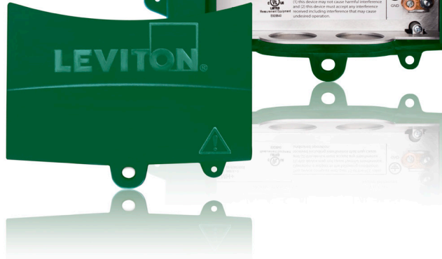
EMH+ All-In-One Data Acquisition Server

Expandable, open protocol system makes growth and adjustments hassle-free