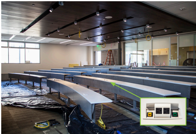
CSUMB Business Information Classroom wired for Cat 6A at each workstation.

“ We’re seeing a lot of growth and expansion... It’s important to keep looking forward.”