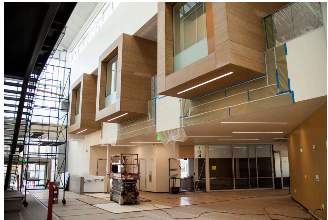
CSUMB Business Information Main Lobby.