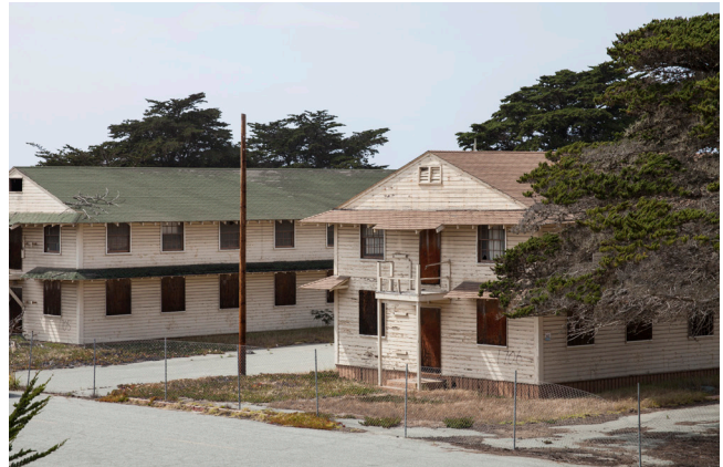
Deserted military barracks to be removed for growth and expansion.

CSUMB hopes to begin construction of several new buildings within the next 2-3 years, including another academic building, a student union, and a dorm facility. “We’re seeing a lot of growth and expansion,” says Clausen. “It’s important to keep looking forward.” The BIT building sets the standard for new facilities, paving the way for a high-performing, intelligent network campus wide.