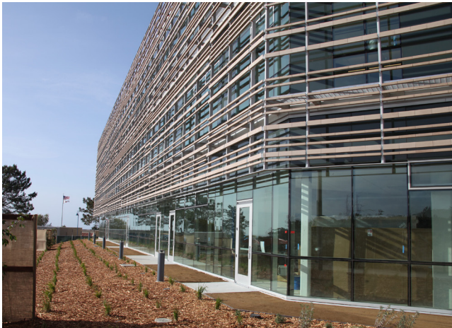
New CSU Monterey Bay Business and Information Technology Building.