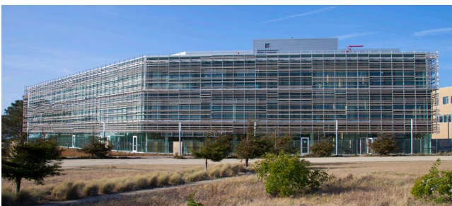
New CSU Monterey Bay Business and Information Technology Building.

In 2014, CSUMB broke ground on a new three-story high, 60,000 square-foot academic facility. The new Business and Information Technology (BIT) building will serve as the primary facility for two fields of study — the School of Business and the School of Information Technology — as well as support classes for many other disciplines. The BIT building depends on state-of-the-art connectivity networked through five telecommunication rooms (TR)