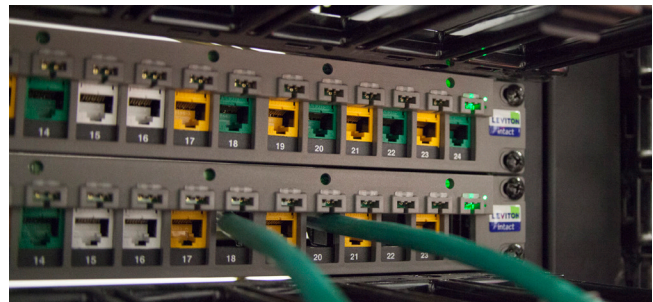
Color-coded Atlas-X1 Connectors installed in an Intact Patch Panel.

“The Atlas-X1 provides dead-on quality and it’s easy to install, saving us time on site.”