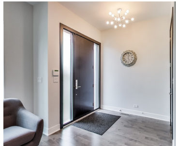
Decora Smart Wi-Fi Dimmers and Switches