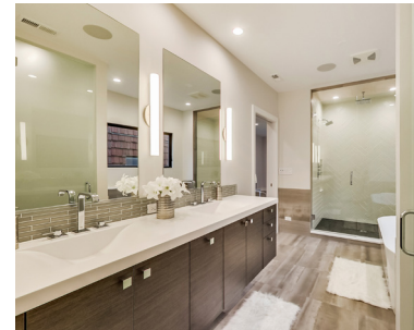
Features include Guide Light GFCI, Decora Smart Wi-Fi dimmers and In-Wall USB Charger