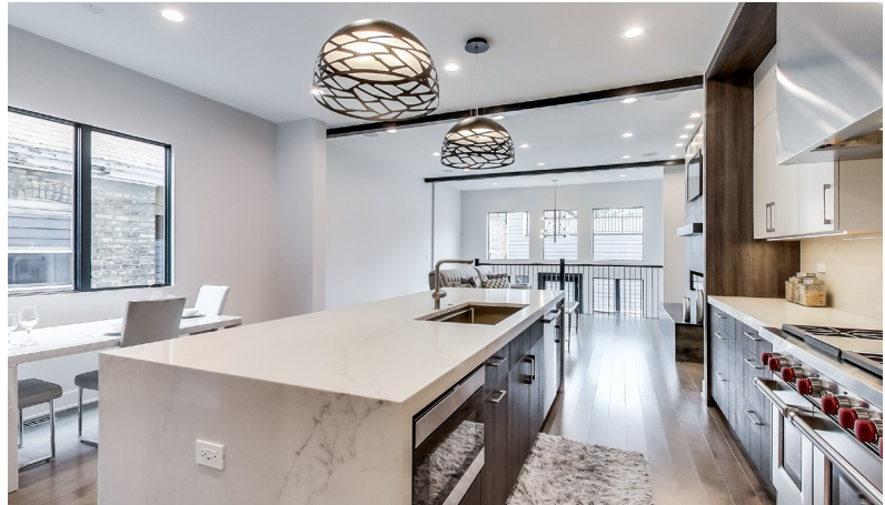
USB In-Wall Chargers are strategically placed in the Island and the back splash for multiple charging options