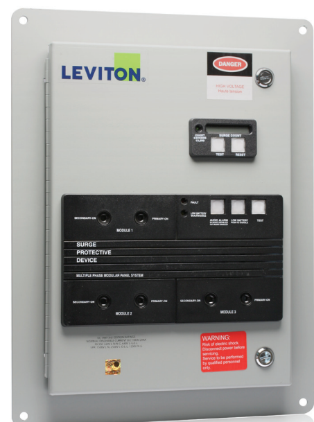
Shown with flush-mount flange (included, but not required for installation)