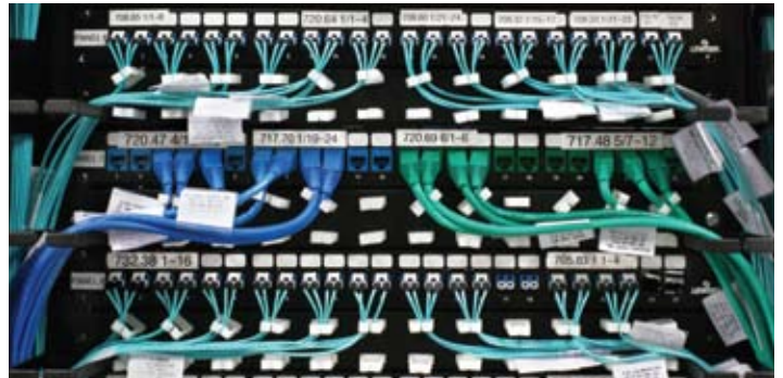
Leviton patch panels, connectors, and patch cords provide copper and fiber connectivity throughout the CBTS data centers