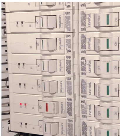
Breaker switch in tripped position clearly notifies of a ground-fault trip

The load center is generally installed in the basement of Cerrone homes – some are finished, and some are not based upon customer preference. Either way, Cerrone Builders is very meticulous and insists all basements, including the utility area, be neat and clean in appearance. The Leviton Load Center meets these criteria with its sleek white enclosure, white circuit breakers with LED indicator lights, and optional observation window in the cover for at-a-glance operating status of all the circuit breakers.