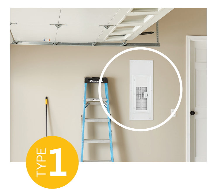
Type 1 SPDs: Intended for installation between the secondary side of the service transformer and the line side of the service equipment, as well as the load side. Protect against external surges caused by lightning or utility capacitor bank switching. Type 1 devices can automatically be used in Type 2 applications.