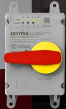
Non-Metallic Safety Disconnects with Inform Technology