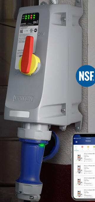
LEV Series Mechanical Interlocks with Inform Technology