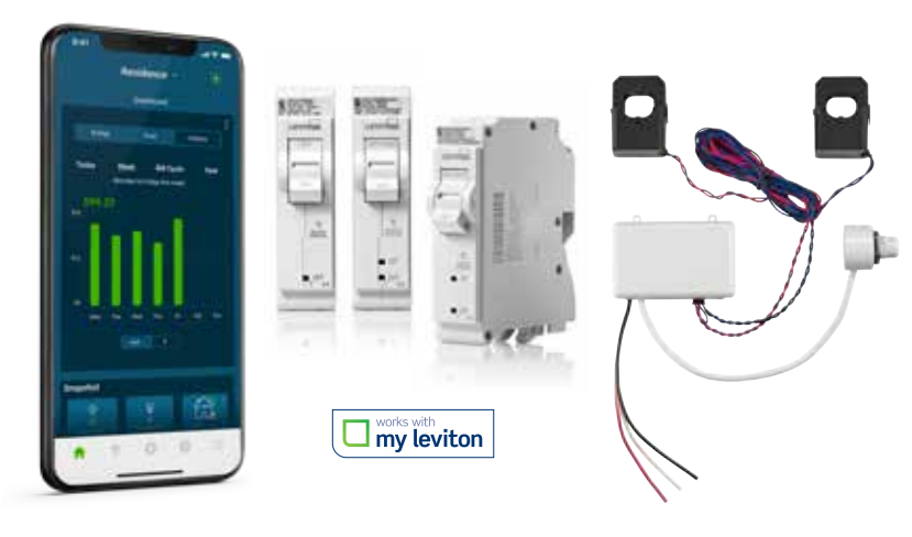
1.\,\mathrm{For} applications up to 60A when using copper wire; or 50A when using aluminum wire. *LWHEM sold separately