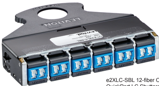
e2XLC-SBL 12-fiber OS2 QuickPort LC Shuttered Cassette