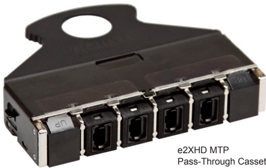
e2XHD MTP Pass-Through Cassette

The e2XHD Patching System, an easy-to-connect, high-density solution, provides simple termination and improved cable routing for both fiber and copper applications. QuickPort Pass-Through Cassettes quickly snap-in and pull out of the e2XHD high-density panels, making installation easier than ever.